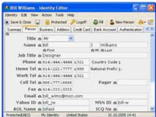
Enter data into RoboForm's Identity card and fill in online forms.

RoboForm is a $30 program with more features for password management, privacy, and password identification than any other program I know. You provide RoboForm with all the vitals you might need to complete a site's form--name, address, phone numbers, and even credit card numbers. When you click the Fill Forms button, the program does just that. I've created multiple identities, each with different info. For instance, I have one with MasterCard info, another with VISA accounts. I have another identify I call "anonymous" that I use to fill in forms on sites that I'll never visit again.